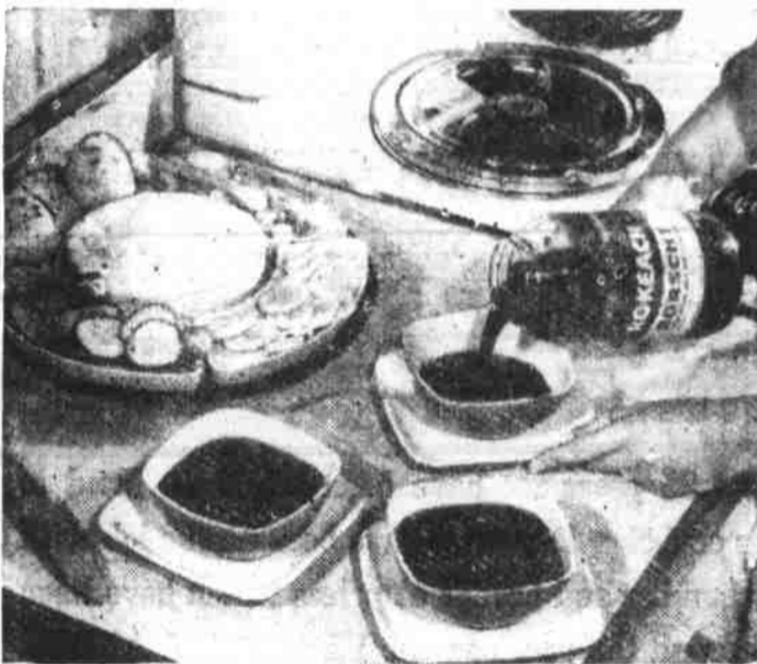
CHILLED SOUP . . . Try Borscht with sour cream.