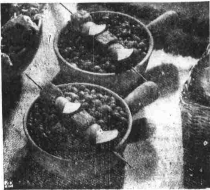
BEAN CASSEROLE . . . With a skewer of tasty morsels.

Canned baked beans are a widely-used food that taste better when you've added a home touch. One man I know likes to season the molasses variety with Worcestershire sauce, curry powder, onion salt and then add diced fresh tomatoes as they heat. For a tasty baked bean casserole, empty canned Boston baked beans into individual casseroles, and add two tablespoons of molasses to each dish, stirring it in. String cubes of cooked ham or luncheon meat, tiny cooked onion rings (they come ready-prepared in jars), and small wedges of apple on skewers or steel knitting needles; heat in a moderate oven until the beans are bubbly and hot. Serve with a vegetable salad, milk, and muffins.