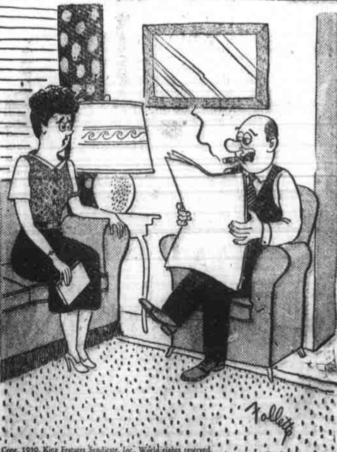
"Oh, say, your brother stopped me on the street today and tried to borrow a dollar. Had him pinched for pan-handling."

Copyright, 1950, King Features Syndicate, Inc. World rights reserved.