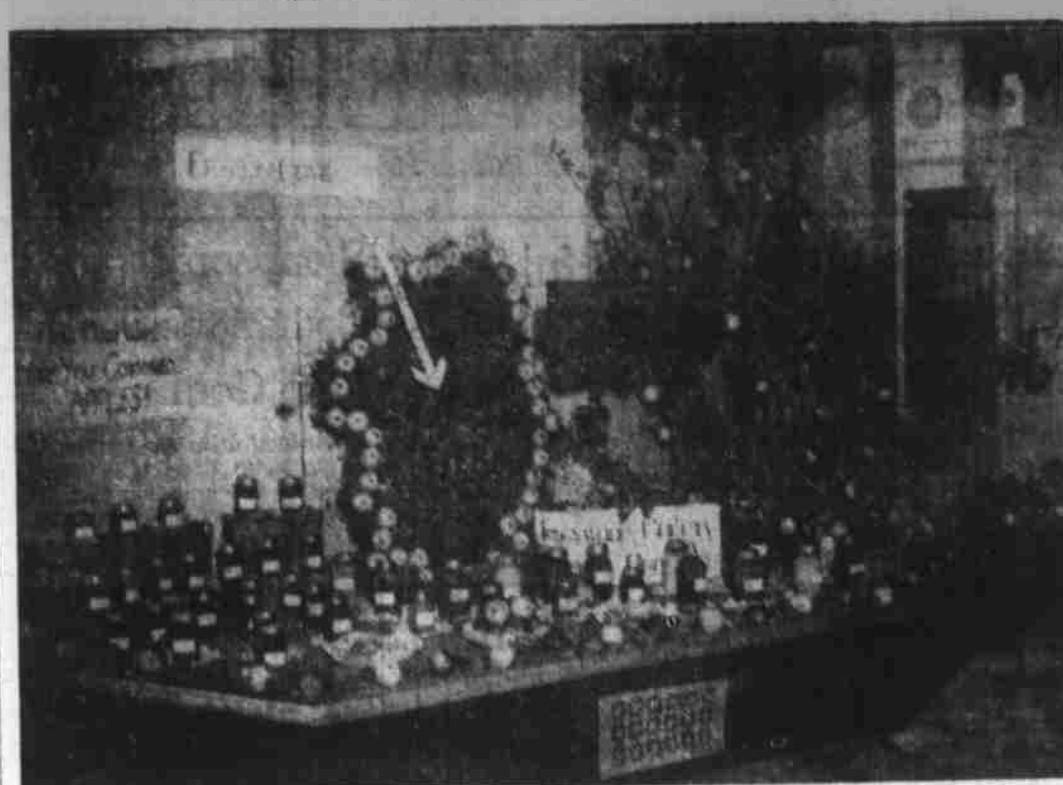
This is the Francis Cove display showing a map of apples, with the heart made of red apples as Francis Cove. The display is at The Toggery.