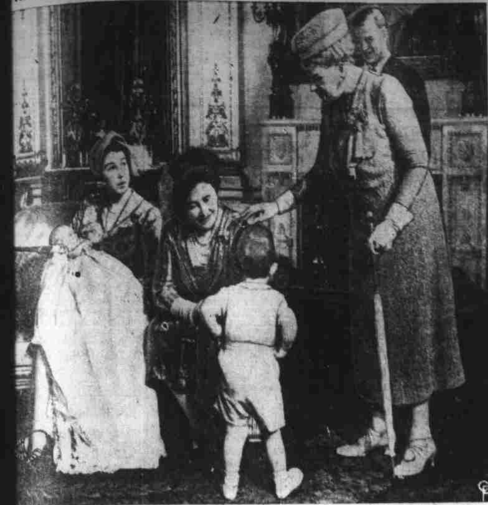
ING WITH HANDS ON HIPS (back to camera) little Prince Charles gets his share of attention at a royal gathering in Buckingham Palace, London, following the christening of his sister, Princess Anne. At Princess Elizabeth, holds the new baby, while the Dowager Queen Mary pats the princeling on the head Queen Elizabeth tries to amuse him. In background, smiling, is the Duke of Edinburgh.