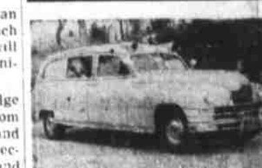
24-Hour Service Crawford Funeral Home Crawford Mutual Burial Ass'n. Waynesville, Phone 147 Canton, Dial 3535

The White River, a Colorado tributary, gets its name from the white-walled canyons through which it flows.