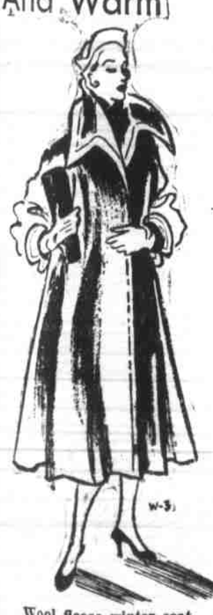
Wool fleece winter coat.