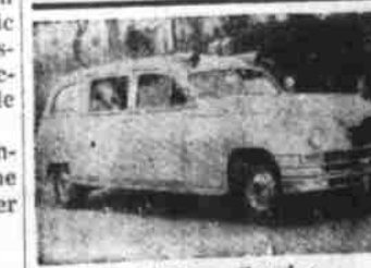
24-Hour Service Crawford Funeral Home Crawford Mutual Burial Ass'n. Waynesville, Phone 147 Canton, Dial 3335