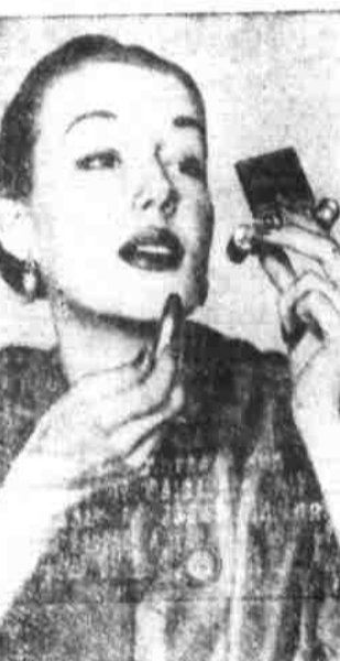
SMALL WONDER . . . Gold-tooled leather with lipstick, perfume. By Majestic.