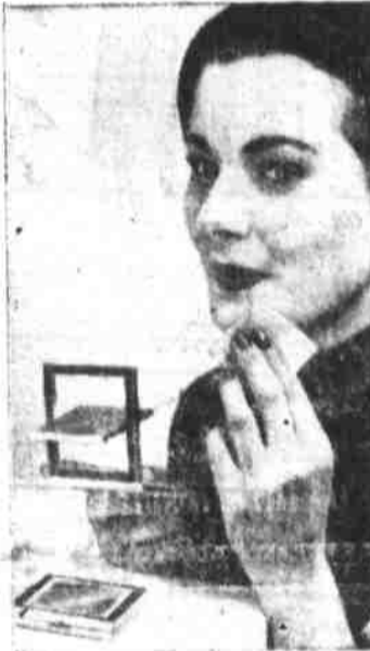
YULE SURPRISE . . . Compact has turnabout mirror for quick flip. By Volupte.