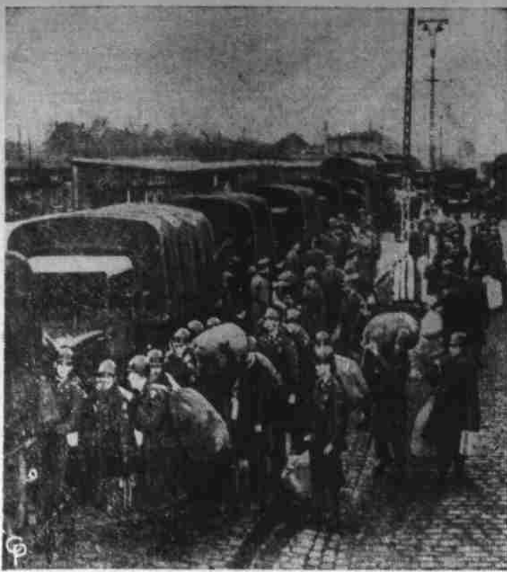
ARRIVING IN THE U. S. SECTOR of Berlin, American troop reinforcements are transferred to Army trucks at the Lichterfelde Station. Members of the headquarters company of the newly-formed 6th Infantry Regiment, they are among the first group to reach Germany under the new plan for strengthening American forces in this danger zone.