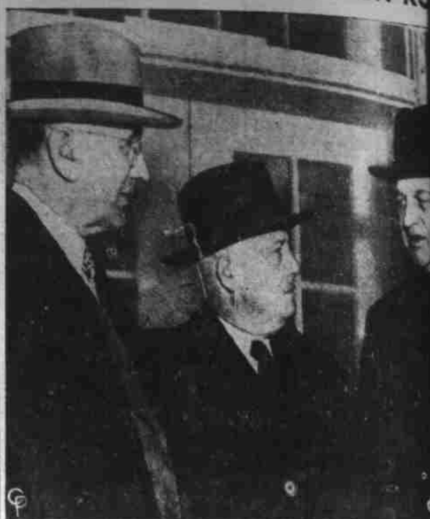
AFTER ANOTHER top-level conference with President Truman critical situation in Korea and the Far East, these Congressional leaders leave the White House. They are (l. to r.): House Majority Leader McCormack, Massachusetts; Speaker of the House Sam Rayburn, and Senate Majority Leader Scott Lucas, Illinois.