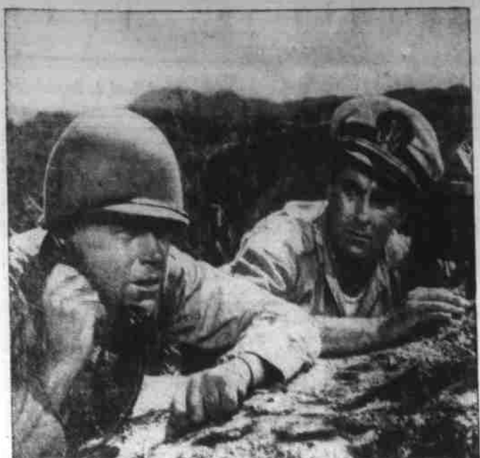
Tyrone Power appears with Tom Ewell in an action packed scene from the Twentieth Century-Fox Technicolor adventure, "American Guerrilla in the Philippines," coming to the Strand Theatre Sunday, Monday and Tuesday.