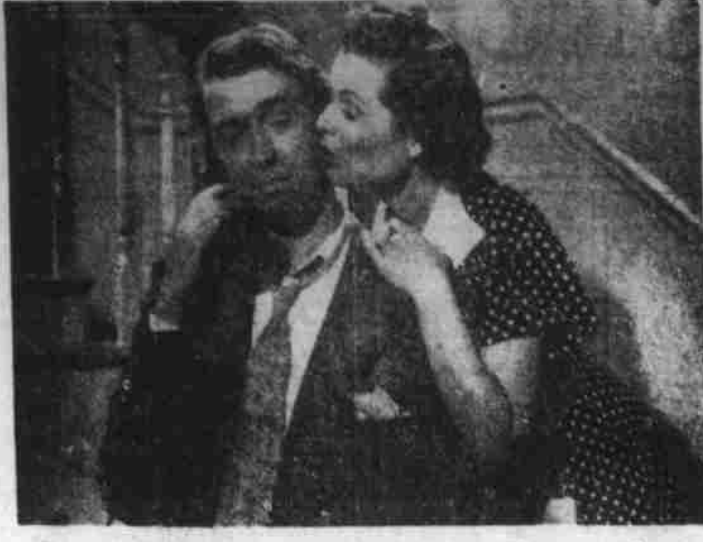
Barbara Hale comforts James Stewart in this scene from the comedy "The Jackpot."