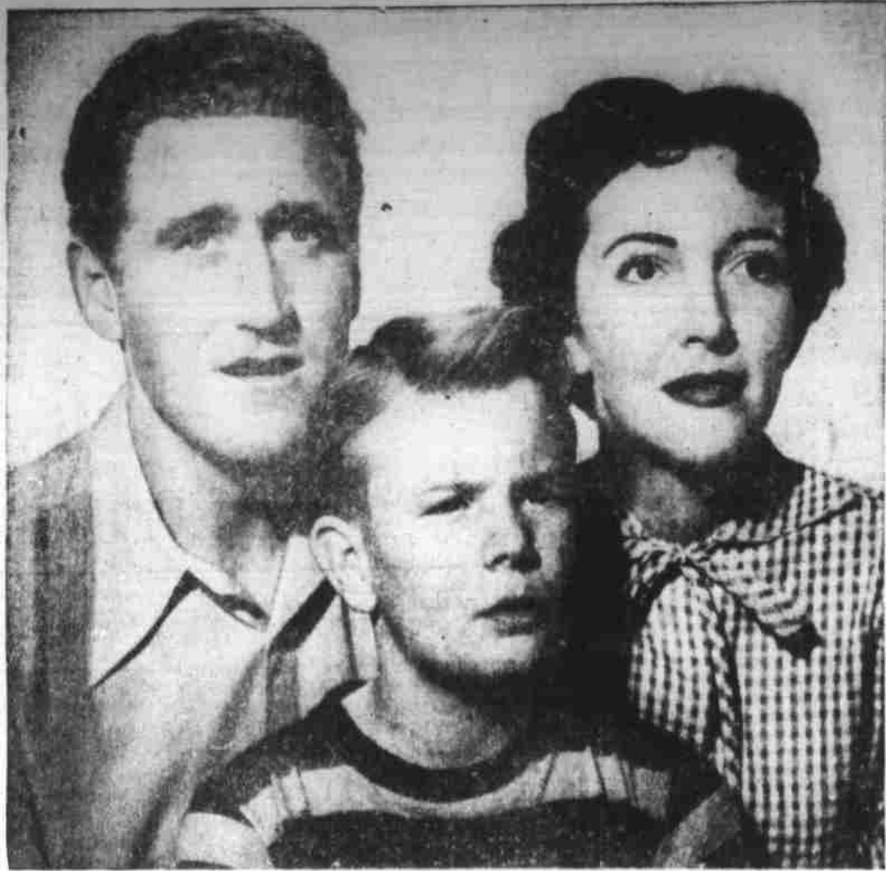
James Whitmore and Nancy Davis, as Mr. and Mrs. Joe Smith, and young Gary Gray, as their son Johnny, represent the typical American family in M-G-M's much-talked-about "The Next Voice You Hear..."