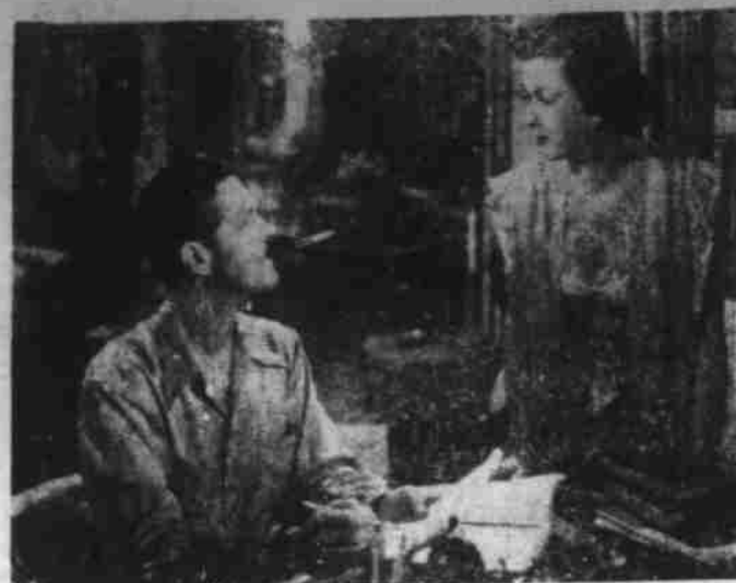
Robert Cummings and Joan Bennett in an anniversary scene from "For Heaven's Sake" which stars Clifton Webb and Edmund Gwenn with the pair.