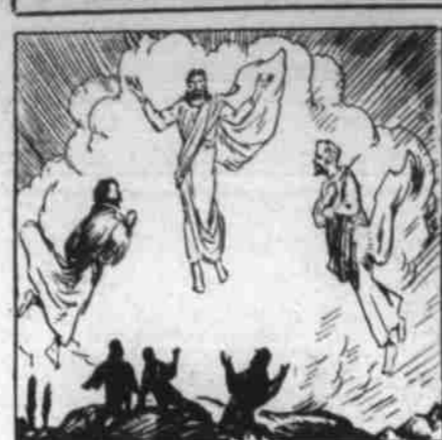
Jesus, taking with Him Peter, James and John, went up into a high mountain, and there was transfigured, and Moses and Elias were with Him. A cloud shadowed them, from which a voice said, "This is My beloved Son: hear Him."