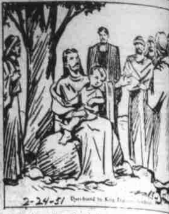
Finding the disciples arguing as to who of them would be greatest in His Kingdom, Jesus took a little child in His arms, telling them that he who would be first among them must be the servant of all. MEMORY VERSE —Mark 9:35