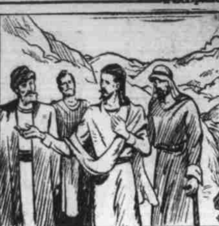
Suddenly the vision disappeared and the three disciples found themselves alone with the Master. As they walked down the mountainside, Jesus charged them that they tell no man what they had seen and heard until He was risen.