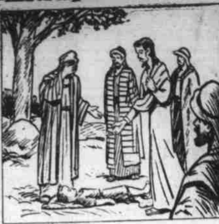
A multitude met them. A scribe came to Jesus and told Him of his son who was possessed of an evil spirit. Jesus expelled the spirit but the child lay as one dead; but Jesus lifted him up and he was well.