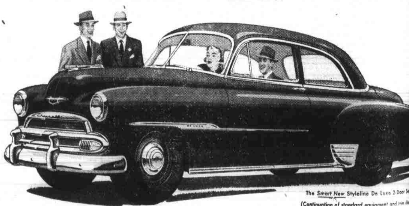
The Smart New Styleline De Luxe 2-Door Sedan (Continuation of standard equipment and trim items is dependent on availability of material.)