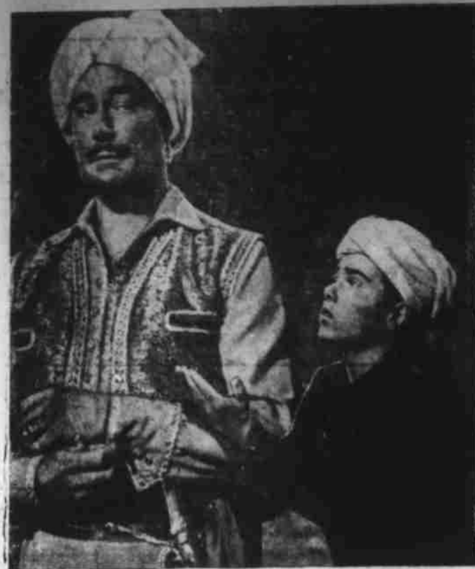
Dean Stockwell, posing as a little Hindu beggar, demonstrates his skill before Errol Flynn in "Kim," M-G-M's vivid filmization of Rudyard Kipling's classic story of romance, adventure and intrigue, coming at the Strand Theatre Sunday, Monday and Tuesday. The new picture is hailed as the first major Hollywood production ever to be filmed in India against authentic locales.

see you again: "How would you like to have dinner at our house (before the party or movie or dance)?" It is possible that he might refuse because of shyness, although few boys are ever too shy to turn down a dinner invitation. If he does turn you down, wait until he gets to know the family better before inviting him again. Even if your first date is a boy whom you decide you never want