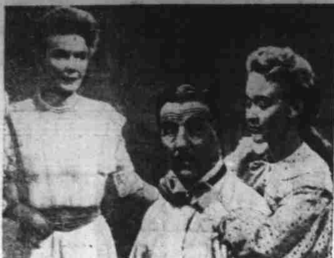
Ann Harding, Louis Calhern and Jane Powell in a domestic scene from "Two Weeks With Love." The technicolor musical also stars Ricardo Montalban.