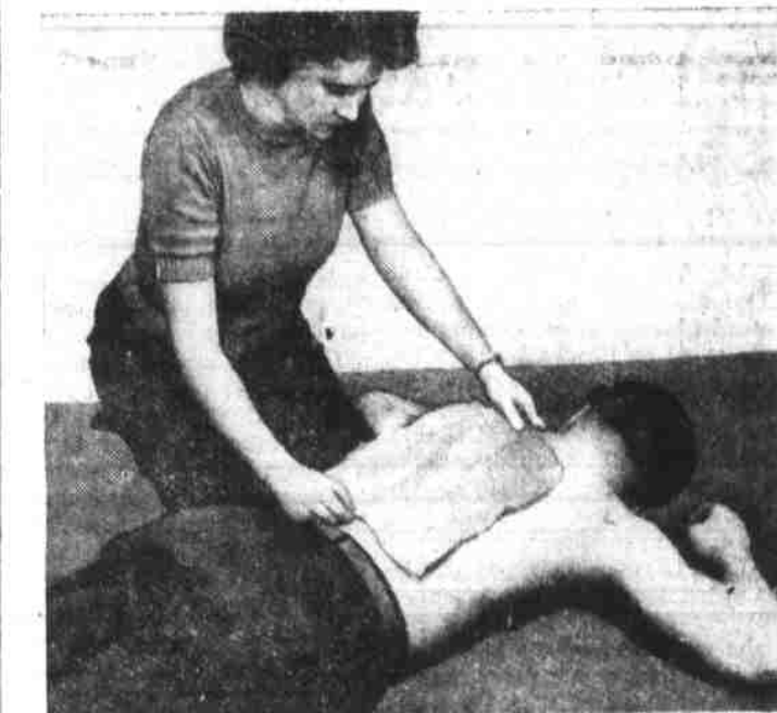
FOR SOME BURNS dry dressings should be applied as shown here. Do you know what material to use? Could you recognize cases where it cannot be used?