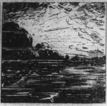
God said, Let there be light; and there was light, and God divided the light from the darkness.