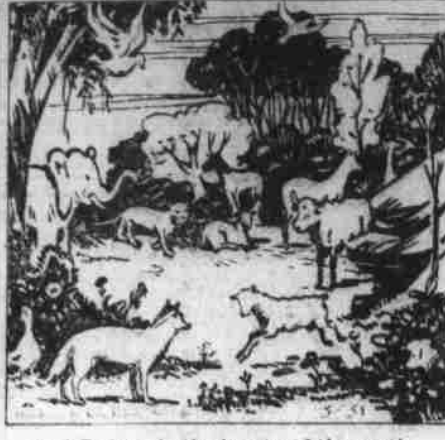
And God made the beasts of the earth and everything that creepeth.