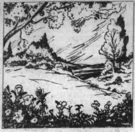
And God said, Let the earth bring forth grass, the herb yielding seed, and the fruit tree yielding fruit.