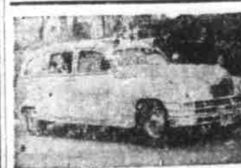
24-Hour Service Crawford Funeral Home Crawford Mutual Burial Ass'n Waynesville, Phone 147 Canton, Dial 3535

Grandsons served as pallbearers and granddaughters were flower bearers. Wells Funeral Home, Canton, was in charge.