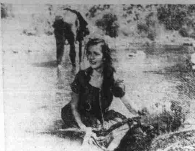
Cathy Downs drags Rod Cameron to safety in this scene from "Short Grass."