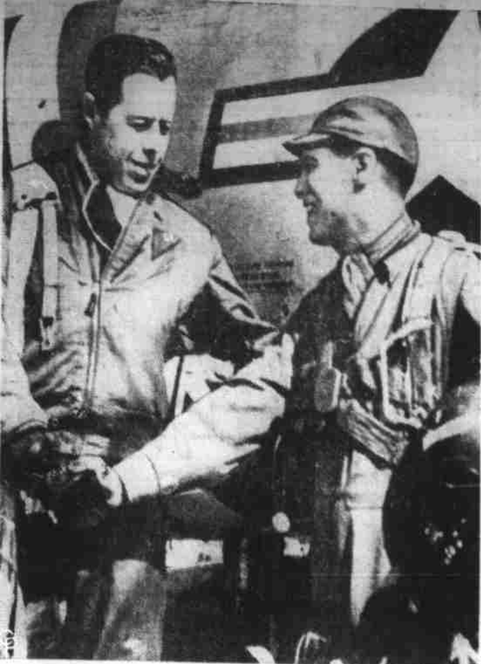
FOLLOWING THE GREATEST AIR BATTLE of the Korean war, Capt. James Jabara, of Wichita, Kas., is congratulated at an air base in Japan by Col. John C. Meyer (left), of Forest Hills, N. Y. Capt. Jabara brought down his third MIG jet fighter.