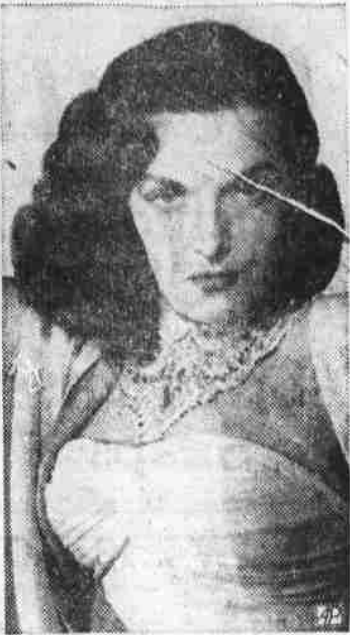
JANE RUSSELL . . . The eyes have it . . .

Exclusively for Newsfeatures JANE RUSSELL I've often heard the only thing they'd be caught without. I agree it's important to me the first item is my mascara. I have a real rush to get my mascara on. I don't get a chance to blink until later. I notice a woman's eyes are the most important features of her face. No irregular or unattractive features. If she will beautify her eyes, her face will be attractive. Remember, when you look at your eyes, he looks at your eyes.