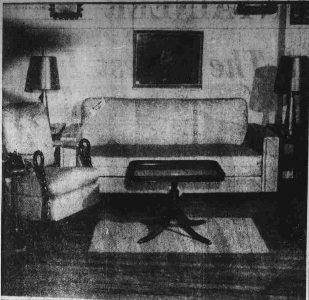
New upholstery texture-pattern Sofabed in Firestone velon, photographed from stock in Garrett Furniture Company's modern Main street store. The plastic patterns of assorted colors in the embossed effect look like fine brocatelle and matelasse. Customer's assurance of first quality, washable, long-wearing plastic. The dual purpose sofa-bed is most practical in today's home. Matching chairs and platform rockers also on display at Garrett's... moderately priced with Garrett's usual convenient terms.