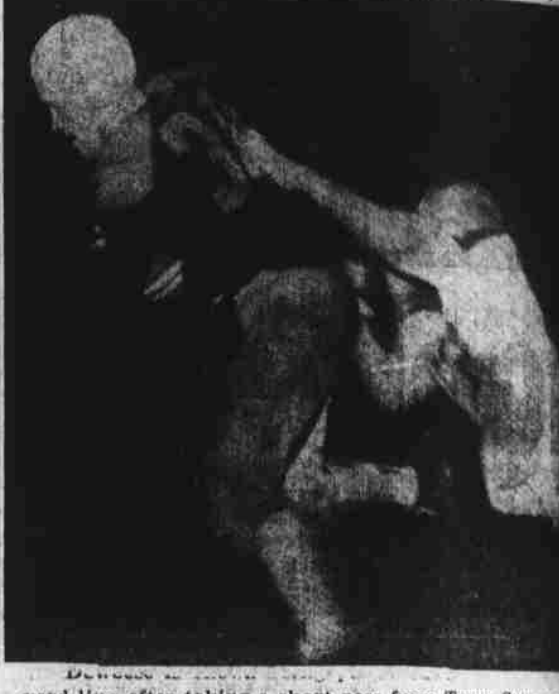
yard line after taking a short pass from Terry Swanger made eight yards on the play which was one of the lot of the night as well as the only pass completion Staff