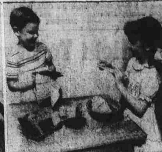
DOMESTIC SCENE . . . Toy dish-washing set, complete with soap and towels. All selected by American Toy Institute.

BEGINNING at the Westmost corner of Tract No. 19 in Block "B" of Rolling Meadows, plat of which is recorded in Map Book "E," page R-3, Haywood County Registry, said beginning corner also identified as M. O. Galloway's corner and bears N. 79° 25' E. 16 feet from a black oak and is on top of ridge, and runs with watershed of ridge as follows: N. 3° 57' W. 7.2 poles; N. 43° 10' W. 10.2 poles; N. 53° 29' W. 7.14 poles; N. 43° 12' W. 6.44 poles; N. 65° 32' W. 5.48 poles; N. 79° W. 7 poles; N. 80° 36' W. 4.28 poles; N. 39° 31' W. 6.72 poles; N. 37° 40' W. 14.72 poles; N. 28° W. 6.6 poles; N. 1° 33' W. 6.4 poles; N. 51° W. 10.1 poles; N. 42° 28' W. 4.2 poles; N. 8° 40' W. 8.94 poles; N. 13° 40' W. 6.68 poles; N. 30° 32' W. 6.68 poles; N. 23° 10' W. 6.16 poles; N. 14° 15' W. 5.48 poles; N. 2° 50' E. 4.48 poles; N. 29° 30' W. 4.14 poles; N. 67° 28' W. 4.12 poles; N. 77° 25' W. 5.68 poles; N. 54° 32' W. 6.6 poles; N. 5° 20' W. 5.68 poles; N. 48° W.