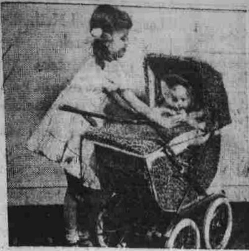
HIGH STYLE DOLL CARRIAGE . . . The last word in 1951 prams is this handsome vehicle covered in make-believe leopard.