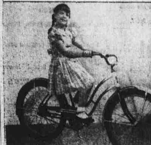
EXPANDING BIKE . . . This new bike, designed by Horace Huffman, grows with the child, is good for four years' use.