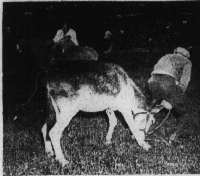
Rider and mount come to a parting of the ways when this jackass, one from the stables of the Buckeye Baseball Club, got tired of running too many bases. There'll be two donkey baseball games on tap Friday when the Hazelwood Boosters Club meets the Hazelwood Fire Department and the Kiwanis and Jaycees back off and butt heads with each other. The games are part of the annual 4th of July celebration on the Waynesville High School field.