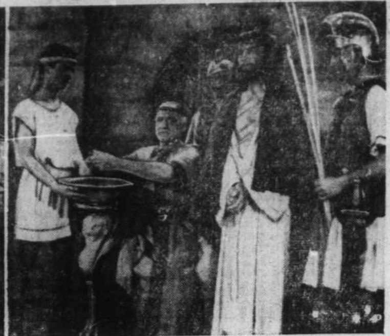
PILATE WASHES HIS HANDS

The crowd still howled for death. "So when Pilate saw that he was gaining nothing, but rather that a riot was beginning, he took water and washed his hands before the crowd, saying, 'I am innocent of this Man's blood; see to it yourselves.' And all the people answered, 'His blood be on us and on our children! Then he released for them Barabbas, and having scourged Jesus, delivered Him to be crucified."