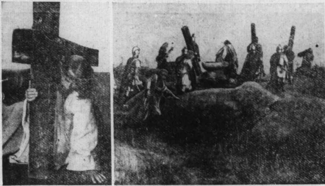
JESUS CARRIES THE CROSS