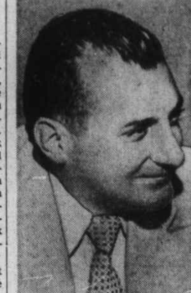
MAJ. CHARLES GARINO, 33, of Framingham, Mass., is shown after he parachuted nearly six miles to safety from his jet fighter when it collided with another jet over the Olympic Peninsula. The planes were from McChord Air Force Base, Tacoma, Wash, Two men flying in the other jet were killed.