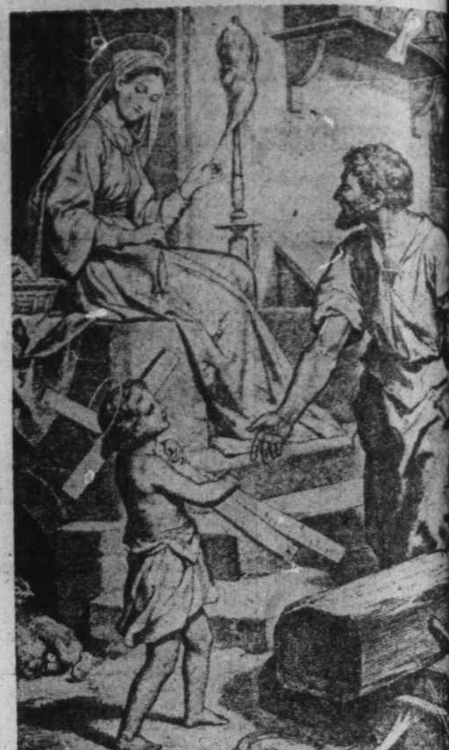
Infancy of Christ. "Speaking the truth in love, may grow up in all things into the head, even Christ."—Ephesians 4:15.