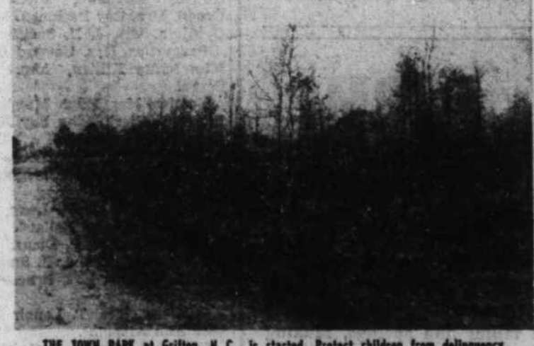
THE TOWN PARK at Griffon, N. C., is started. Protect children from delinquency, adults from boredom with a safe, constructive recreation area. The National Recreation Assn. recommends at least one acre per thousand persons. What about your town?