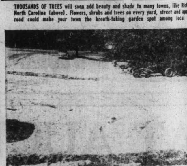
"OFF-STREET PARKING is worth annually $1,000 per car space in crowded town," said one prosperous merchant with figures to prove it! This is one of the two new lots recently opened in Rockingham; more shoppers can park closer to the store.