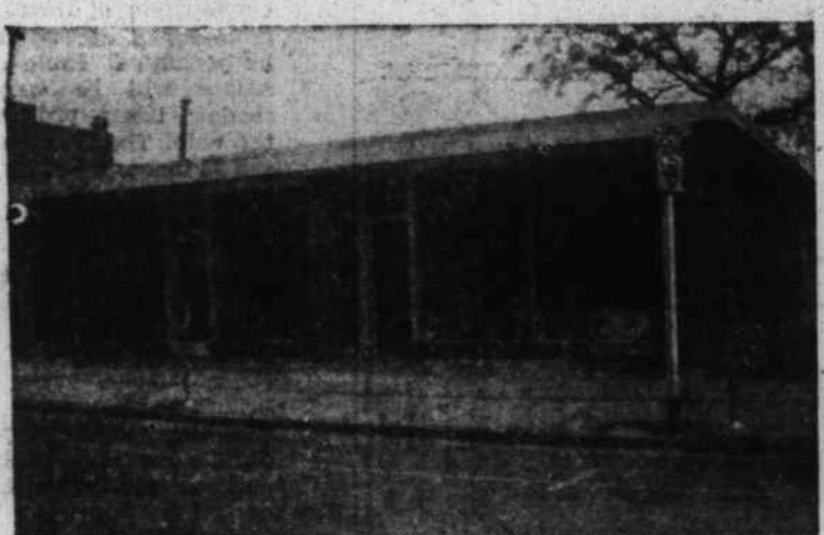
NEW BUILDINGS at Manning, S. C., rose where old "eyesores" once stood. To progressive merchants like these will go the increased business to repay their investment. It's just plain "horse sense" that 1953 merchandise sells better in 1953-model stores.

THE growth and prosperity of a community is limited by lack of imagination far more than by natural hindrances. Imagine your town as it could be, with all the improvements necessary for happier, more prosperous living and work. Then let your effort equal your imagination. Invest your thought and time in community improvements and see the result: better living conditions and more profitable business. Align your efforts with the progressive, civic-minded folks on your local Finer Carolina committee. Add your imagination and enthusiasm to theirs. Read the following examples of community improvements, then remember: "Building a Finer Carolina" is YOUR job too.