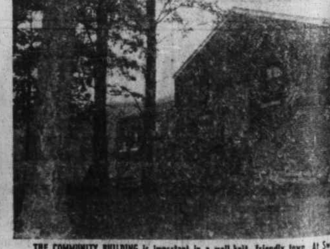
THE COMMUNITY BUILDING is important in a well-built, friendly town. At Swanton, North Carolina, citizens realized the need, raised the money for materials, and built this one with volunteer labor. Every town needs a social and civic center.