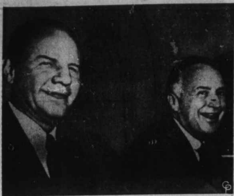
IN GOOD SPIRITS is Walter Robertson (right), trouble-shooter for President Eisenhower in Korea, as he leaves the longest talk he has yet held with South Korean President Syngman Rhee. With him is U. S. Ambassador Robert Murphy. In addition to reported progress made in his negotiations with Dr. Rhee, the Assistant Secretary of State was cheered by the friendly reception given him by civilians and children in Seoul, the South Korean capital.