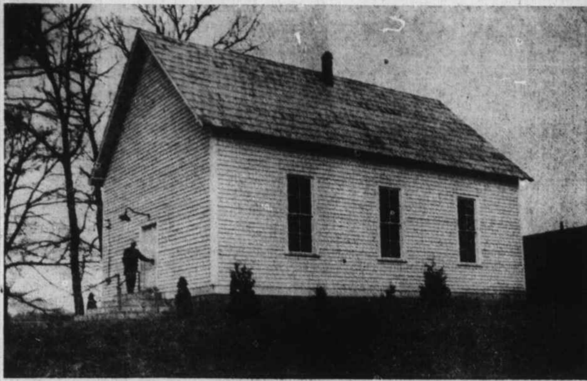
DAVIS CHAPEL METHODIST CHURCH, seen above, will be the gathering place for the Iron Duff Homecoming Sunday, August 16, beginning with services at 10 a. m., followed by a picnic

Under a tribal ruling which went into effect in 1952, all business establishments, including the Cherokee Historical Association projects