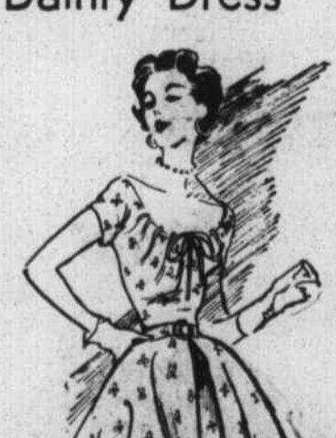
By VERA WINSTON

PURE silk, light as a feather and cool as a breeze is used for a beautiful daytime dress, the color scheme light sand color background with a neat blue print. The neckline is not the least of the attractions, scooped out as it is, with cart-ridge pleating in front and a shoestring bow also in front. The skirt is full with an inverted pleat in front and there is a crotline underneath.