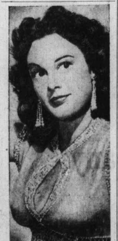
PATRICIA MEDINA is the "Siren of Bagdad" in the new Columbia picture also starring Paul Henreid in color by Technicolor at the Strand Theatre Sunday and Monday.

Color By Technicolor WITH PAUL HENREID PATRICIA MEDINA NEWS - CARTOON