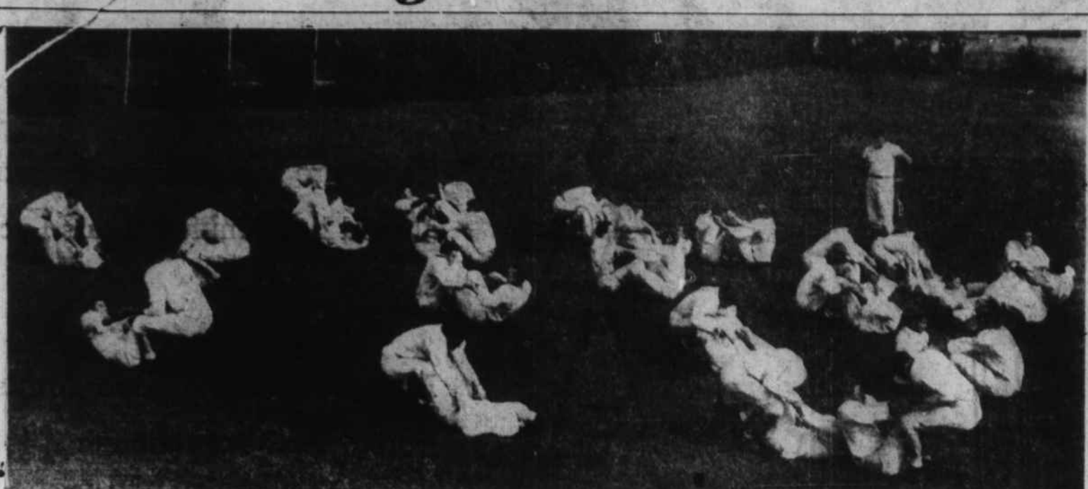
ROCK-A-BYE your partner sounds like a child's game, but to the members of the Mountaineer football squad it was downright hard work. Sitting on each other's feet, the players pulled their partner up, and then he in turn pulled the other man up. It was

Patricia Medina is the "Siren of Bagdad" in the new Columbia picture also starring Paul Henreid in color by Technicolor at the Strand Theatre Sunday and Monday.