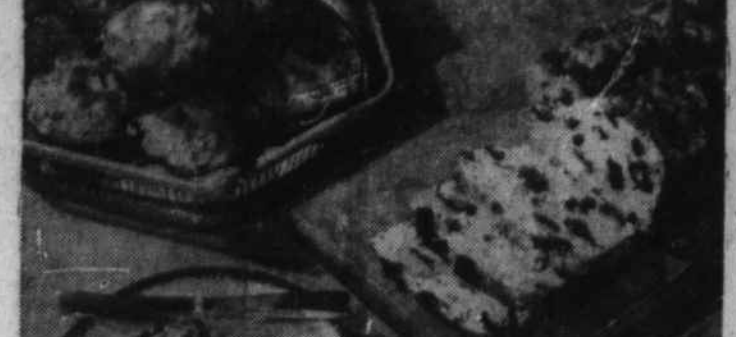
VARIATIONS on oatmeal quick bread good for snacks

By CECILY BROWNSTONE Associated Press Food Editor ists agree, because many boys and Makes about 5 dozen cookies. girls who work and play hard MINCEMEAT COOKIES: Prebecause boys and girls need the meat with bran and walnuts. warm feeling of having Mother wel-