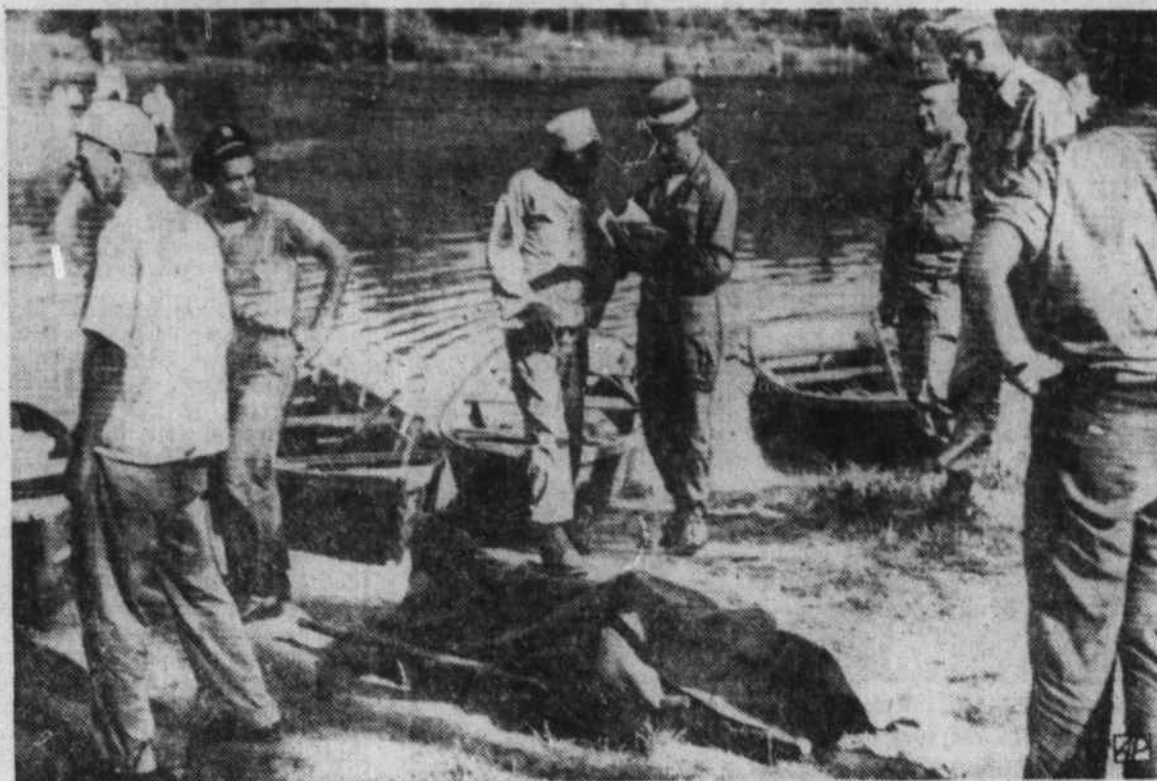
LAST OF DROWNED SOLDIERS RECOVERED —The body of a soldier lies covered on a stretcher after it was pulled from the lake in the background on the Ft. Bragg reservation. The victim was one of 20 trainees who lost their lives in a mishap while on routine training mission. Authorities said that the men were riding on two engine assault craft bolted together and were being returned to shore from a section of a pontoon bridge.