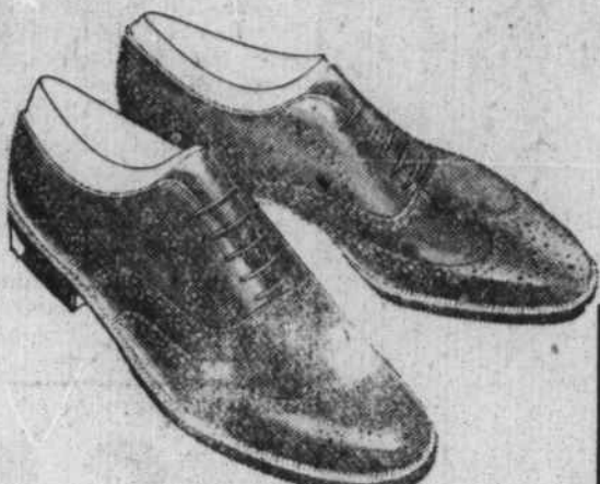
29 Pairs Men's Dress

SHOES Sizes 6 to 9 1/2 14.95 Values SPECIAL $5