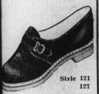
Style 121 127

Buckle on comfort and casual good looks with this crepe soled Fall favorite in black musuede with smooth black binding or brown musuede with russet binding. As smartly a styled walking shoe as you'll find anywhere. Only