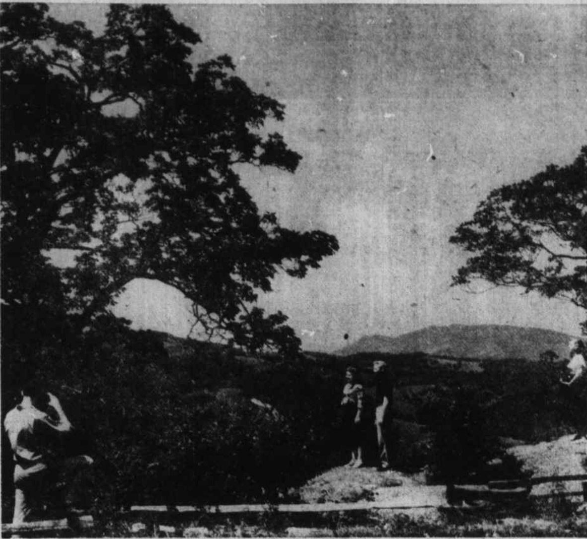
COLOR PHOTOGRAPHERS can be found at every turn and at every look-out on the beautiful Western North Carolina roads these days as the color peak of the season approaches this week end. Foliage is expected to be at its height of color on the peaks this week and in the lower areas the following week. Now's the time to get that perfect color shot.

This drill was one feature of the observance of Fire Prevention Week.