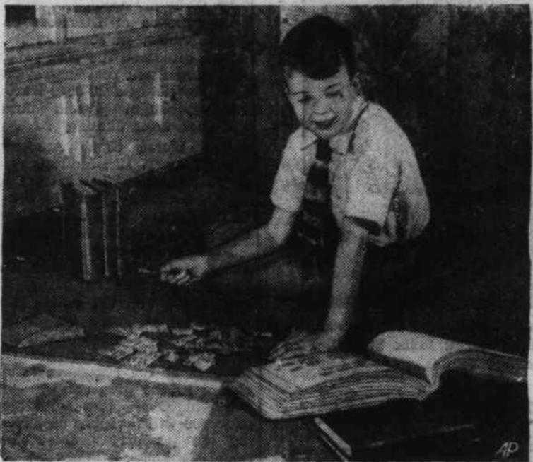
A STAMP ALBUM, a starter collection of stamps and a map of the world gives a boy a lifetime hobby of value.