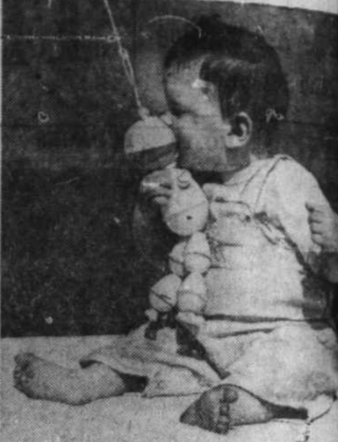
LET 'EM CHEW! The newest plastic toys for playpen set are safe for chewing. This hangs from crib, pen or carriage.