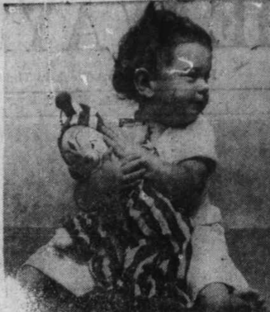
OH, YOU BEAUTIFUL DOLL! This very young lady loves her cuddly fabric doll, in clown suit, one of Santa's top toys.