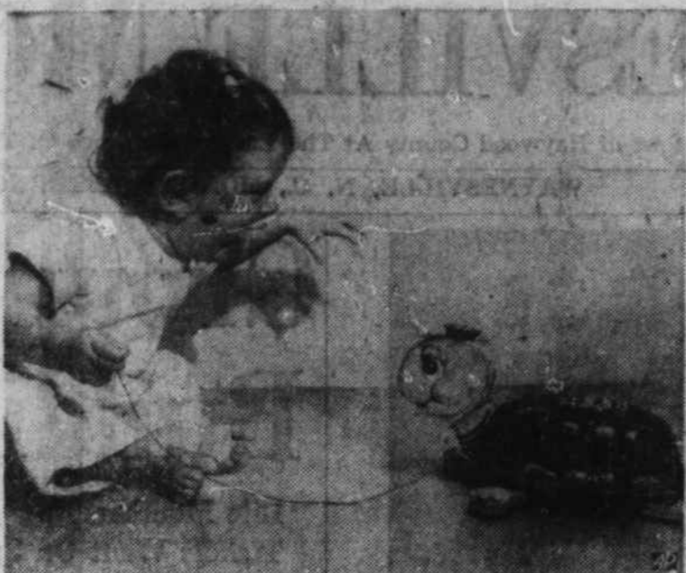
THE VOICE OF THE TURTLE . . . Myrtle, the musical turtle, has legs and head that move realistically as a tune plays while she is pulled along by escatic tot.