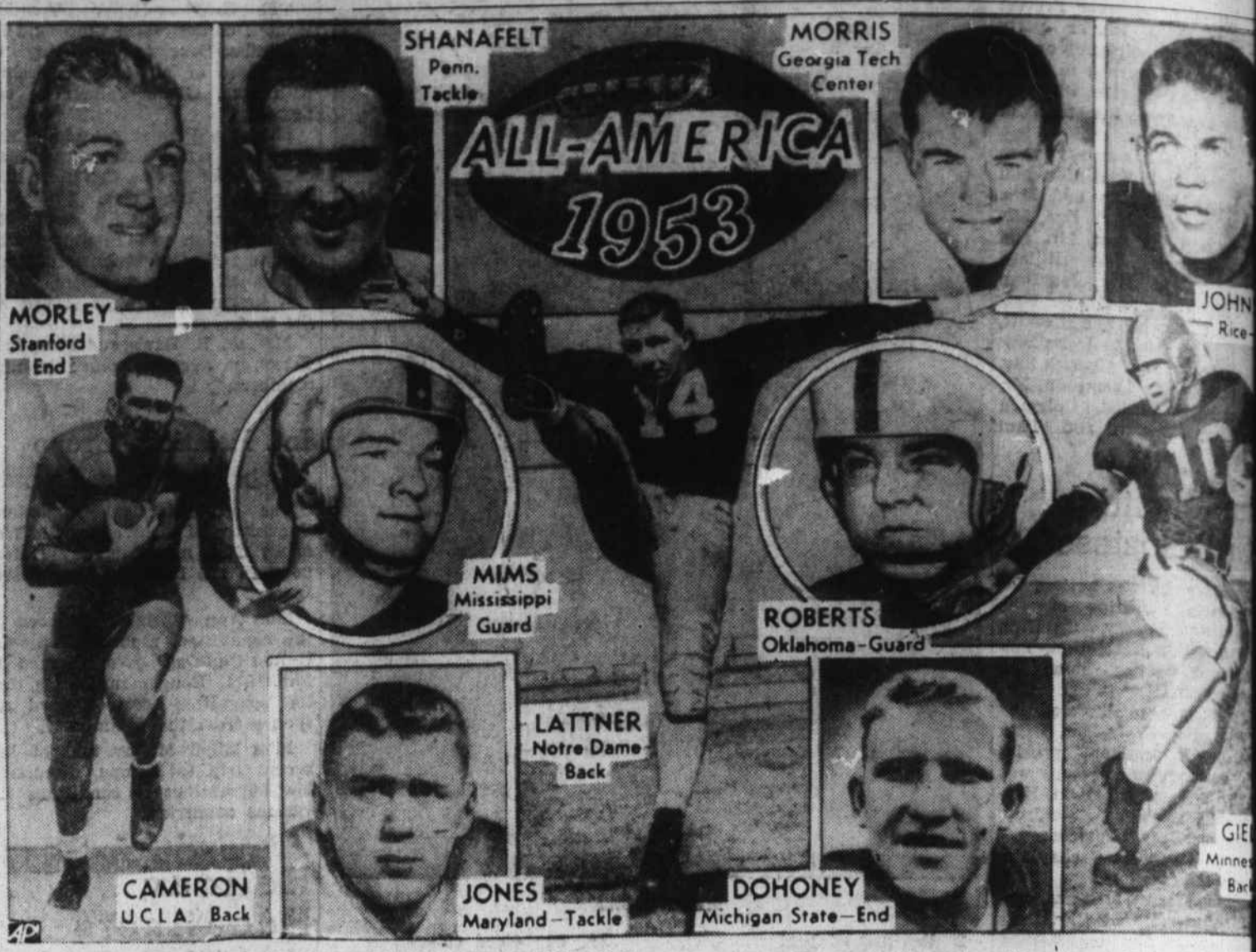
THE ASSOCIATED PRESS ALL-AMERICA TEAM FOR 1953— as chosen by a poll of sports writers across the nation. Here is The Associated Press All-America football team for 1953