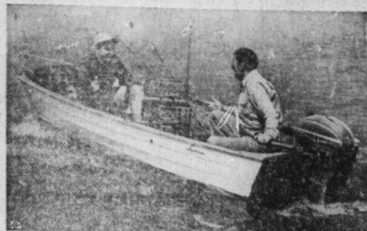
FOR THE SPORTSMAN - a new quiet outboard motor that lets you listen to your favorite ball game, converse in normal tones and hear the slap of waves against the bow of the boat. The motor rates 5 1/2 horsepower.