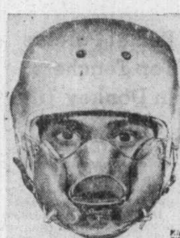
SAVE FACE, in football with this plastic protector. Coaches hail it as a means to reduce the high number of facial injuries.

kick out of the new "Safe-T-Vue" face protector. It may make him look like a monster but he'll be more apt to come out of a scrimmage with his usual facial expressions. Rawlings of St. Louis, the manufacturer of the plastic face guard, which can be attached to a football helmet, says 53.9 percent of all recorded injuries in football last year were injuries in the face and dental area. It sure would be nice to give little brother more than his two front teeth for Christmas.