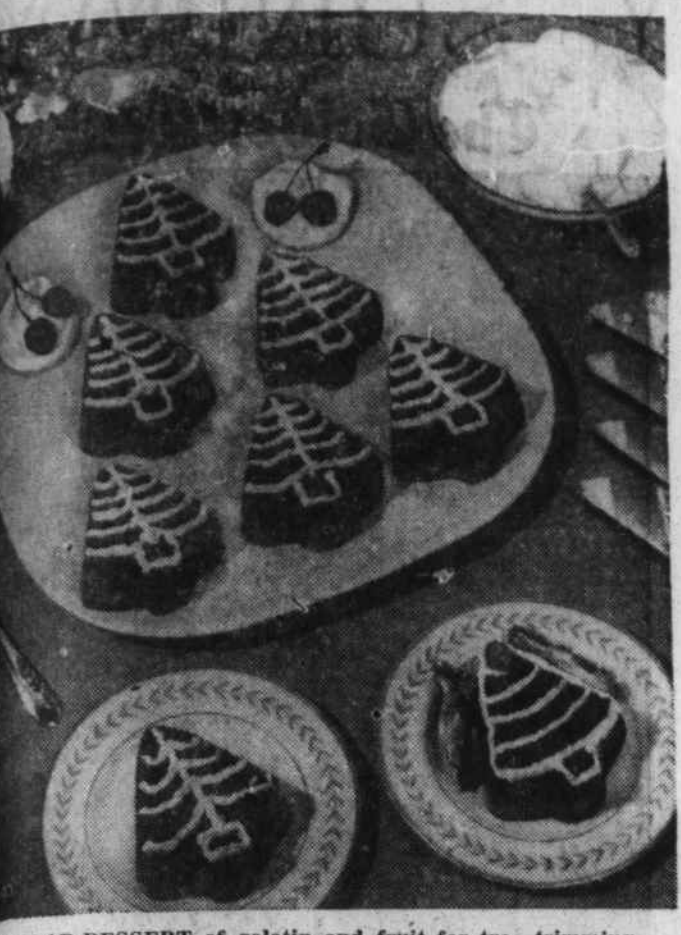
SALAD-DESSERT of gelatin and fruit for tree trimming