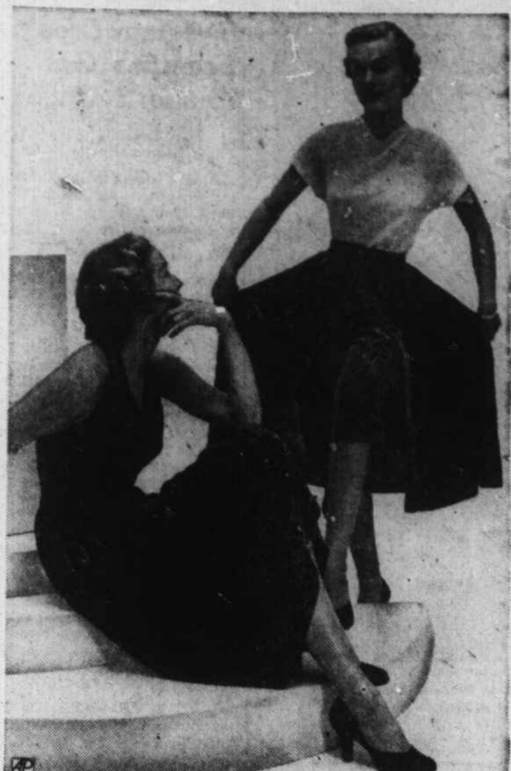
DRESSY SEPARATES show that all that glitters may not be gold, because it's Luranit, a non-tarnishable Lurex thread blended with rayon knit. The soft pleat skirts are worn with halter or cowl neck blouses and smart pants for a glamorous picture for after-5 leisure. (Koret of California)