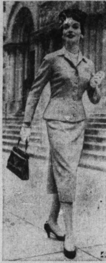
LONGER JACKET... This smooth town suit is made of tissue tweed with a linen-like weave. Softly tailored jacket has side vent pockets plus breast pockets.