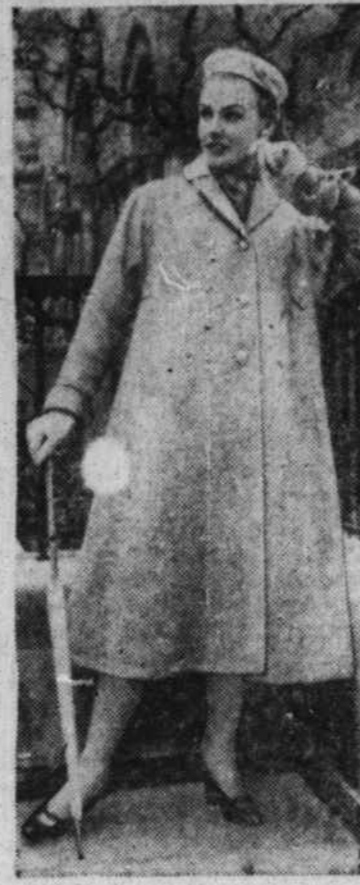
SPRING TOPPER... Right for town, country or travel is this dashing coat with vivid scarf and lining, in light multicolor tweed. Designed by Forstmann.