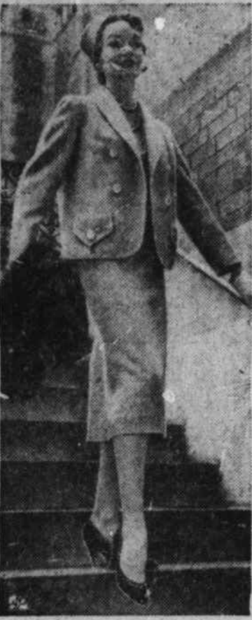
BOXY SILHOUETTE... Easter bouquet tweed in two zephyr weights makes this smart suit. Jacket is slightly heavier tweed than matching skirt.