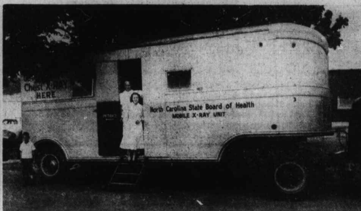
THIS MOBILE X-RAY LAB which came to Hazelwood Friday will be joined by another unit next week for a mass X-ray survey in Haywood County which will continue through June 11.