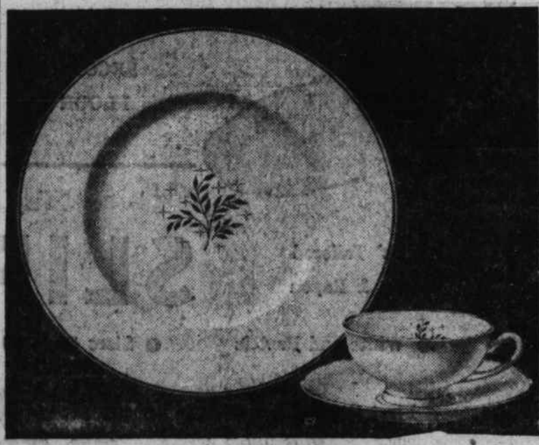
A center of delicate green leaflets accented by a Platinum line. 5 Piece Place Setting $9.75