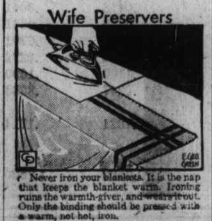
Never iron your blankets. It is the nap that keeps the blanket warm. Ironing ruins the warmth, and wears the wool. Only the binding should be pressed with a warm, not hot, iron.

Lackland AFB, San Antonio, Texas, Future plans for the unit call for radio, TV, concert and parade appearances at the Minneapolis Aquatennial, Cheyenne, Wyoming's nationally famous Frontier Days, and the celebrated Scafair in Seattle, Washington.