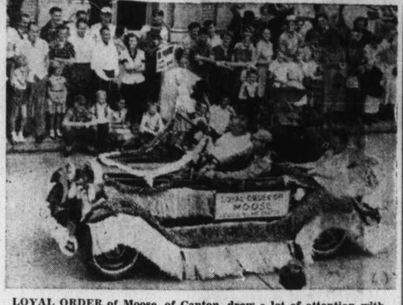
LOYAL ORDER of Moose, of Canton, drew a lot of attention with their float bearing the head of a large moose as they rode in the Canton parade Monday.