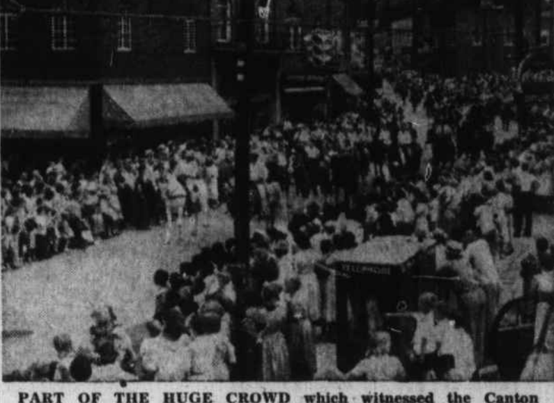
PART OF THE HUGE CROWD which witnessed the Canton Labor Day Parade Monday. This shows a group of horses coming.