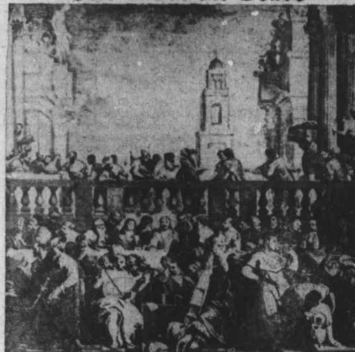
The marriage feast.

"Whoever exalteth himself shall be abased; and he that humbleth himself shall be exalted."—Luke 14:11.