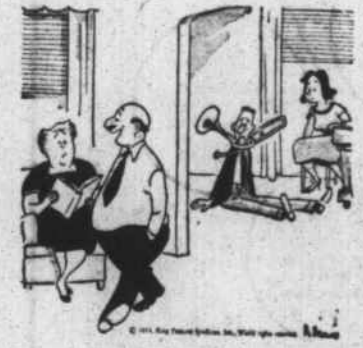
"I just broke the sound barrier!"