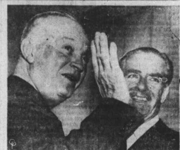
PRESIDENT EISENHOWER waves to newsmen as he escorts visiting British Prime Minister Anthony Eden into the White House after they posed for photographers on the North portico of the official residence. They immediately began a series of talks in which they were expected to review problems in many sections of the world, with an accent on Middle East affairs.

Gentry-Liner Oil Company Dial GL 6-8331 or GL 6-8639