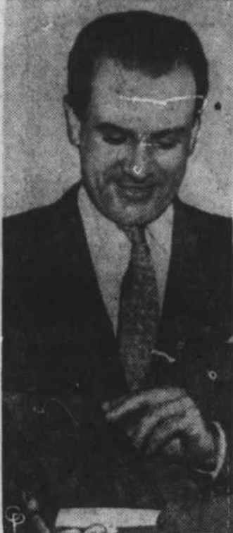
CONGRESSMAN Bruce Alger (R-Tex.) is shown with the copy of the 100th anniversary edition of the Texas Almanac he presented in Washington to Sherman Adams, Presidential assistant. The book was accepted on behalf of President Eisenhower.