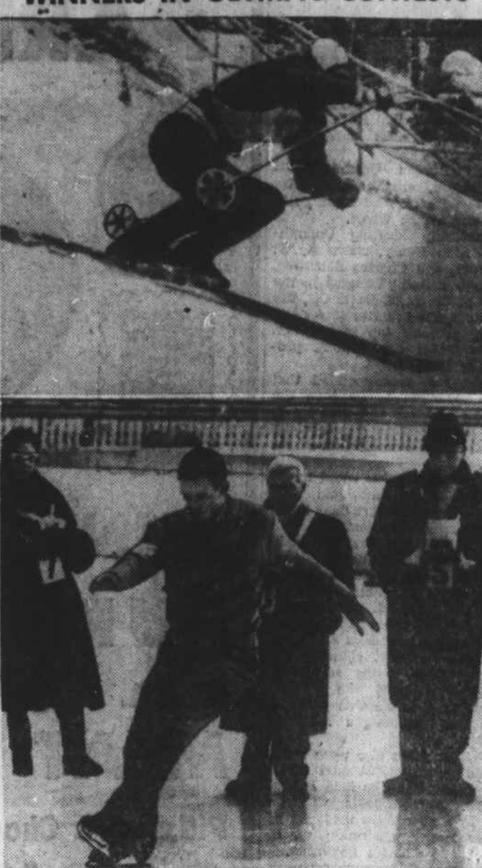
RENEE COLLIARD of Switzerland is shown (top) as she won the ladies' special slalom at the winter Olympics in Cortina d'Ampezzo, Italy, dethroning Andrea Mead Lawrence of the U.S. However, Allen Hayes Jenkins (bottom) won a first place for the U.S. with 852.5 points in men's figure skating.