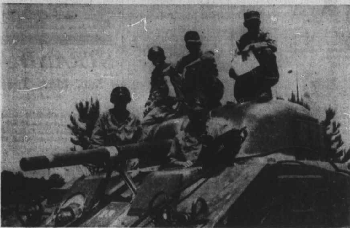
EACH SUMMER men of Waynesville's Tank Company, 120th Infantry, North Carolina National Guard, get practical training in tank tactics at