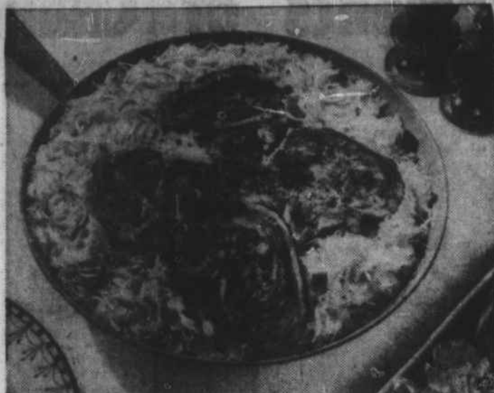
SAUERKRAUT AND DICED APPLE surrounds skillet pork chops.