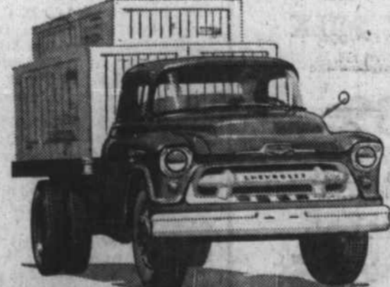
New Middleweight Champs

Meet today's most modern truck fleet! It offers new champs of every weight class, including four new heavy-duty series. It brings you new power for every job, with a modern short-stroke V8* for every model.