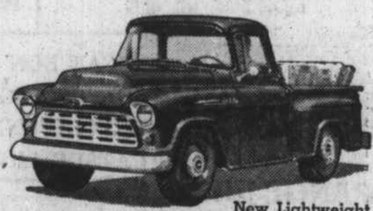
New Lightweight Champs

New models to do bigger jobs—rated up to 32,000 lbs. G.V.W.! New power right across the board—with a brand-new big V8 for high-tonnage hauling! New automatic and 5-speed transmissions!