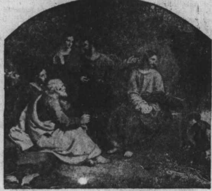
Christ weeps over Jerusalem. "If thou hadst known, even thou, at least in this thy day, the things which belong unto peace."—Luke 19:42.