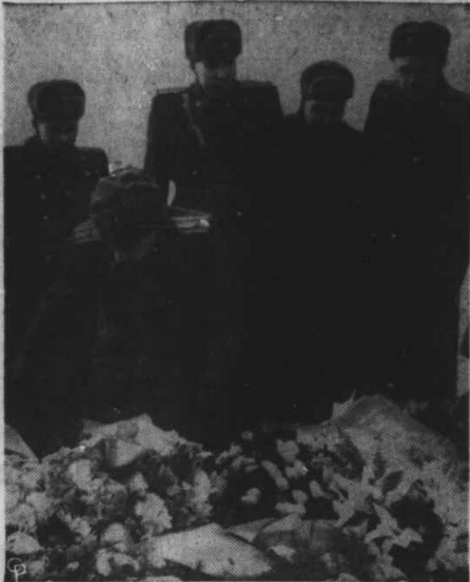
A DELEGATION of Red Army officers places wreaths on the Soviet war memorial in the British sector of West Berlin, about 400 yards away from the Russian zone, on the 38th anniversary of Red Army Day. This was the only place outside the Iron Curtain where the Communists celebrated the founding of their army.