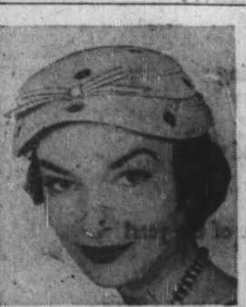
Small hats are larger this spring this smooth toyo straw et with pert full-face veil,

Without fanfare, skirts have been made slightly shorter. Just below the knee lengths appear in the spring collections of some de-