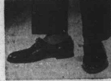
Three-eyelot low cut shoe in perforated fine grain tropical leather.