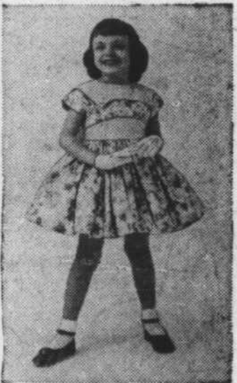
Pearl buttons accent collar of a flower-print dress for young charmers. In "Everglaze" washable chintz.