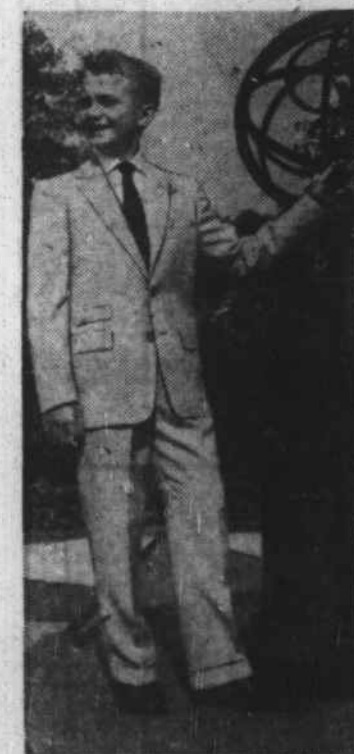
Boys take to spring in a light-colored suit of viscose and acetate twist flannel, with three buttons.

Like curry flavor? Try sprinkling just a suspicion of the spice over scrambled eggs just before they are ready.