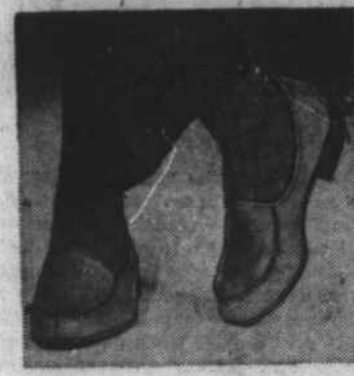
Here's a 1956 variation of the moccasin in supple tropical leather.

SHOP BELK'S for better selections, better buys! BUY BELK'S for certified better values!