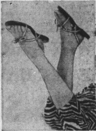
At-home flats in gold kid display Oriental influence.