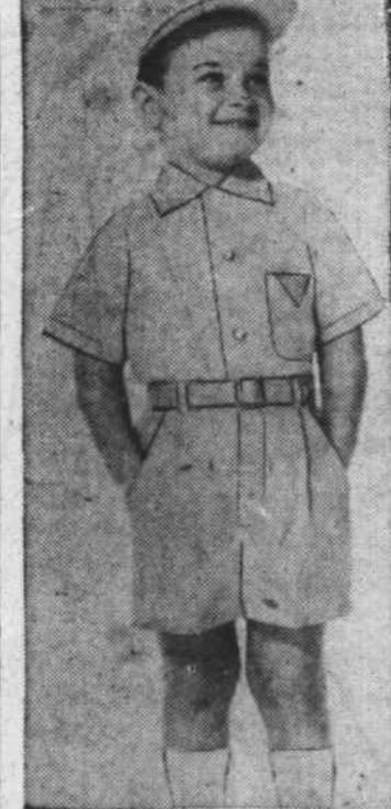
Little men's spring coordinates in combed cotton include cord shorts, belt, cord-trimmed shirt, matching cap.

Among earring fashions are big clusters in round or shower shapes, along with trim contours and slinky string beads. Hoops, larger than ever, are back for a return engagement.