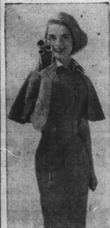
Princess sheath in wool worsted houndstooth check features detachable cape, collar.