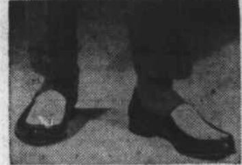
Continental style slip-ons with white vamp plug in soft suede; balance in black tropical leather.