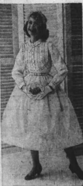
Teenagers sparkle in romantic shirt-waist-style dress with rhinestone accents.