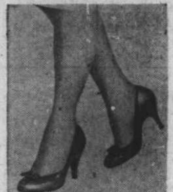
Perfect companion for spring tweeds, textures, pumps of textured calf are trimmed with boot-maker stitches.