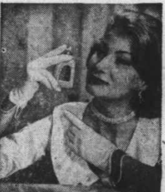
Fabric gloves feature tiny flowers pressed into transparent cuff.