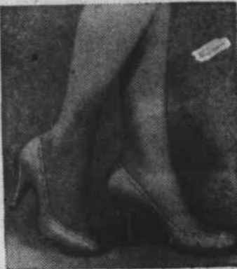
Tapered pump in white calf, perforated to show gold underlay, glamorizes day wear.