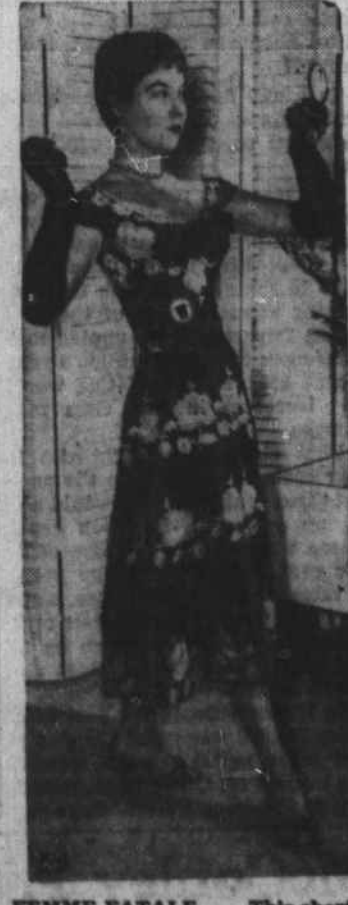
FEMME FATALE . . . This short rmal in black organza gains ama from appliqued white em-broidered organdie flowers.